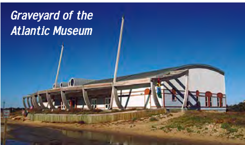
Graveyard of the Atlantic Museum