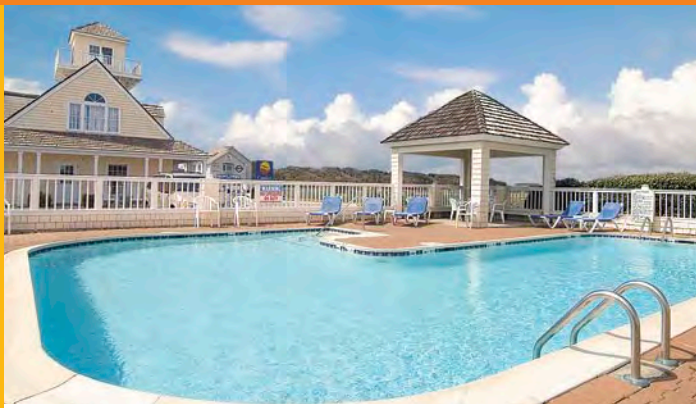
Dive into the best-kept secret on the Outer Banks.