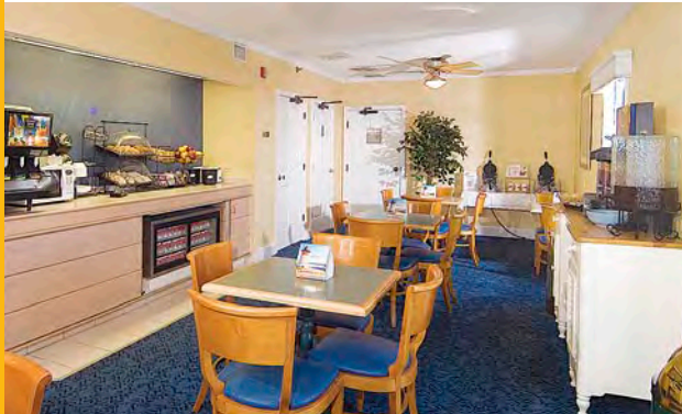
Our complimentary continental breakfast is served daily in our lobby.